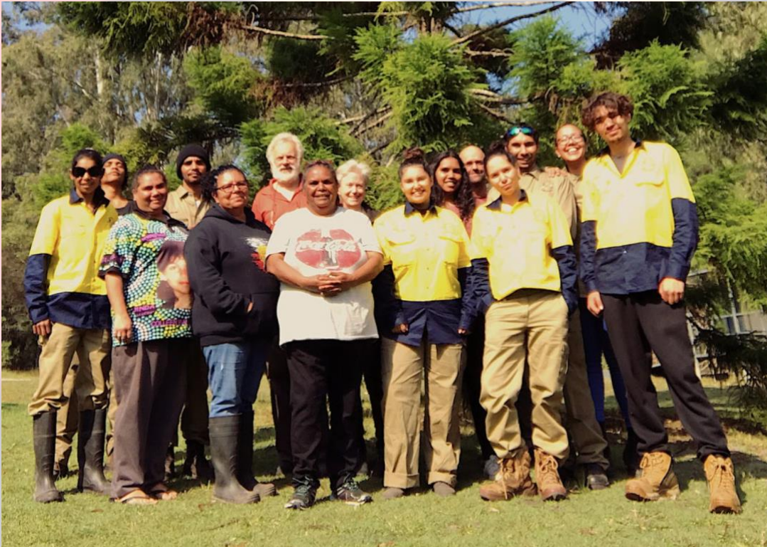
Team Photo, August 2019