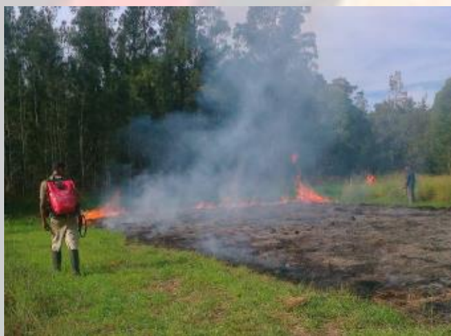
Setaria control operation

continuing our deep relationship with our land and culture, generating employment for the Bandjalang clan